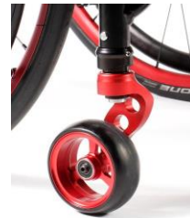
NSW080008 Castor fork, aluminum, one-arm, red