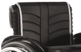
NSW030316 EXO backrest sling