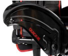
NSW040104 Carbon fibre, cold weather protection, fender