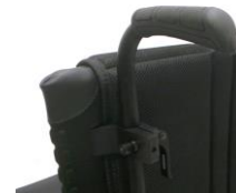
NSW030204 Push handles, height-adjustable