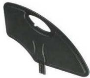
NSW040107 Sideguard, composite, removable (black)