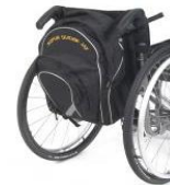
NSW090030 Back pack