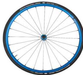
NSW100337 Lightweight wheel, anodized blue