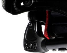
NSW030012 Backrest, angle adjustable