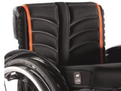
NSW030317 EXO PRO backrest sling