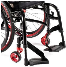
NSW050022 Footboard divided, aluminium, frame colour