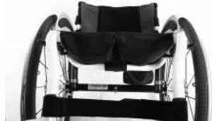
NSW020003 Seat sling with 2 utility bags