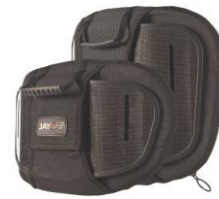
Jay 3 Carbon Back Shallow Contour