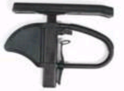
NSW040050 Single-post sideguard