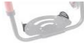
NSW050127 Adjustable side protection