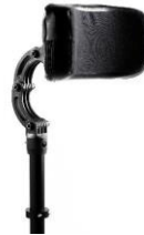
NSW030412 Headrest, medium