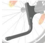
NSW090001 Tip assist