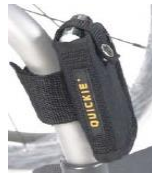
NSW090026 Mobile phone pocket