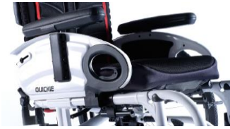
NSW04000x Desk sideguard, armpad, flip-up, removable