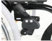
NSW060002 Knee lever brake