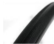
NSW070102 Tyre, puncture proof