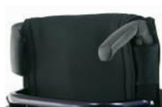
NSW030203 Push handles, fold-down