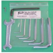
NSW090000 Tool kit