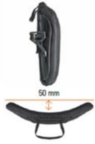
JAY J3 Back Shallow Contour