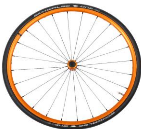
NSW100336 Lightweight wheel, anodized orange