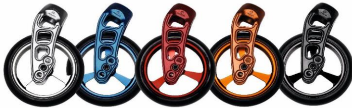
NSW080013 & NSW080306 Castor fork, Carbotecture & Castor solid (soft) aluminum