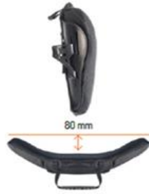
JAY J3 Back Mid Contour