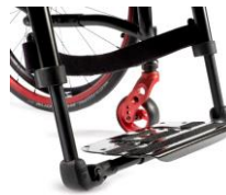
NSW050132 Footboard platform, lightweight, carbon fibre