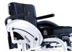
NSW040117 Tubular armrest, swing away, removable, padded