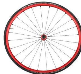
NSW100338 Lightweight wheel, anodized red