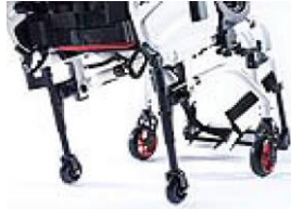
NSW090010 Transit wheels