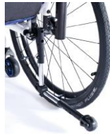
NSW090006 Anti-tip tubes, swing away