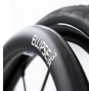
NSW070212 Handrims Ellipse 3R