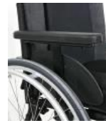
NSW040052 Single-post sideguard, armpad (330 mm)