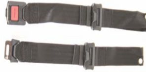
NSW090018 Lap belt with buckle, metal