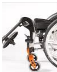
NSW050011 Hanger, aluminum, flip-up (0-90°), Swing-away