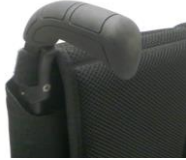
NSW030201 Push handles long