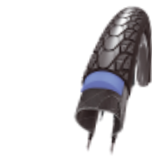
NSW070104 Schwalbe Marathon Plus Evolution