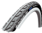
NSW070107 Schwalbe One