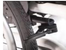
NSW060003 Compact brake