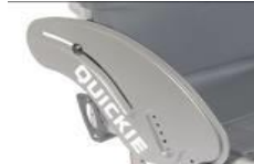
XES040102 Aluminium , cold weather protection