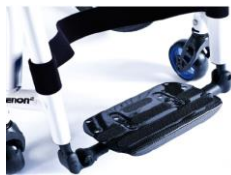
XES050132 Footboard platform, lightweight, carbon fibre