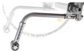
XES090050 Anti-tip tubes, plug in, pair