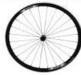
XES07000 Proton wheel