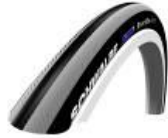
XES070101 Schwalbe Right Run