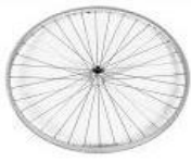
XES070002 Design wheel