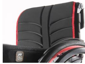
XES 030316 EXO backrest sling (EXO Evo version)