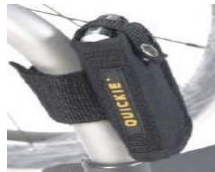
XES090026 Mobile phone pocket