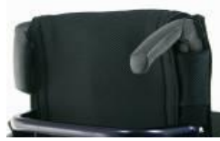
XES 030203 Push handles, fold-down