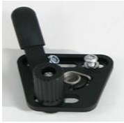
XES060001 Standard brake