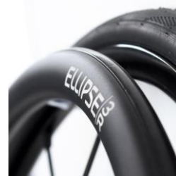
XES070212 Handrims Ellipse 3R