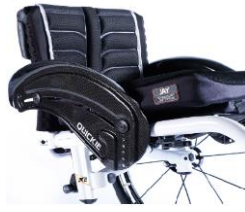
XES040104 Carbon fibre, cold weather protection, fender