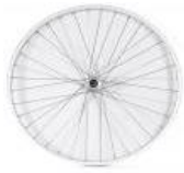
XES070001 Universal wheel