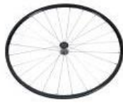
XES070003 Lightweight wheel