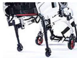
XES090010 Transit wheels