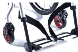
XES050022 Footboard divided, aluminium, frame colour