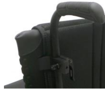
XES 030204 Push handles, height-adjustable