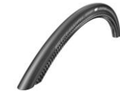
XES070107 Schwalbe One