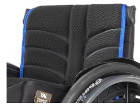
XES 030317 EXO PRO backrest sling (EXO Evo version)