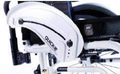
XES040103 Aluminium, cold weather protection, fender