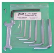
XES090000 Tool kit