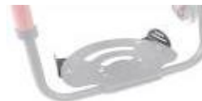
XES050127 Adjustable side protection