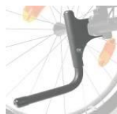
XES090001 Tip assist