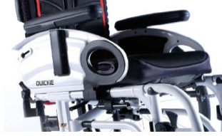
XES04000x Desk sideguard, armrest, flip- up, removable