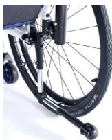
XES090004 Anti-tip tubes, swing away