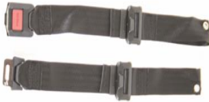
XES 090018 Lap belt with buckle, metal