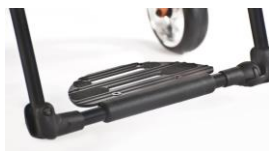
XES050059 Footboard platform, Performance