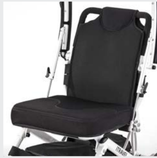
Comfort seat system