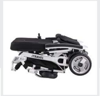
Small pack size