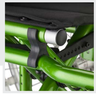
Ultra flexible - a seat that grows with you