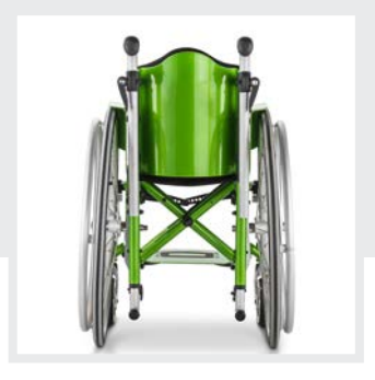
Anatomic back shell, detachable