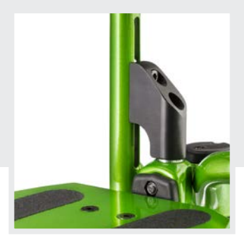
Perfect adjustment of lower leg length