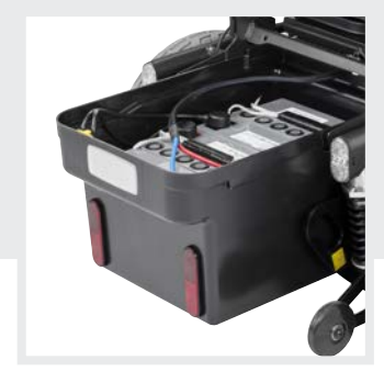
Serviceability Easy battery maintenance thanks to pull-out battery case