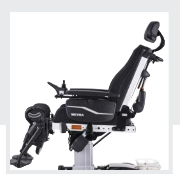
300 mm seat lift