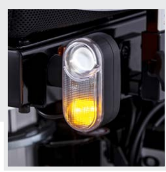
Long-life LED lighting