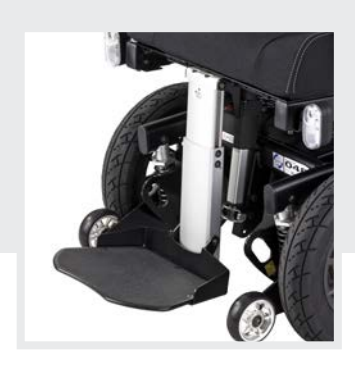
The central legrest enables a 90° knee angle