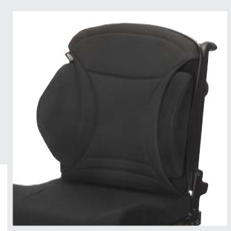
Various optional seating systems