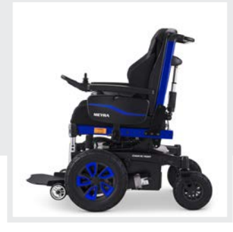
High degree of manoeuvrability due to compact dimensions