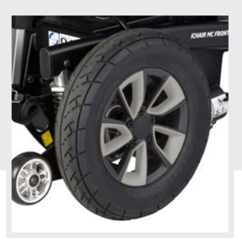
14" drive wheels front