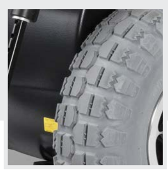
Excellent traction and off-road capability