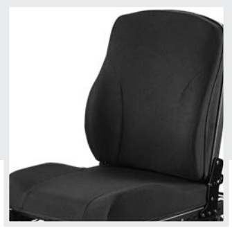
Optimal sitting comfort – optimal adaptability