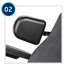
Article 1080610/ 1080612