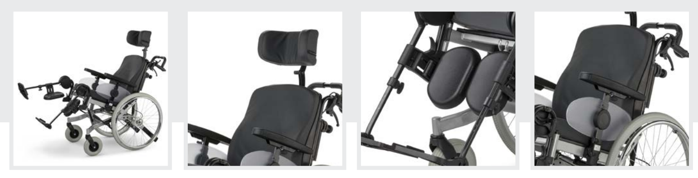
Adaptable in every respect